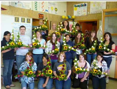
Los Molinos High School Floral Design class benefitted from a grant from the TCAC

Grant funds awarded last fall to the TCAC from the California Arts Council's One Million Plates for the Arts Project ( www.cac.ca.gov/licenseplate ) were used to provide grants to 15 local programs serving local youth and the arts community.